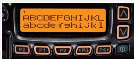
Two line setting display example.

With a high contrast dot matrix display, upper and lower case characters can be easily distinguished. You can change the display setting to show one line and 12 characters, or two lines and 24 characters via programming. LCD backlighting is standard.